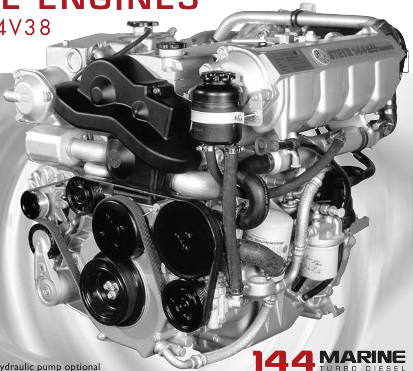
Hydraulic pump optional